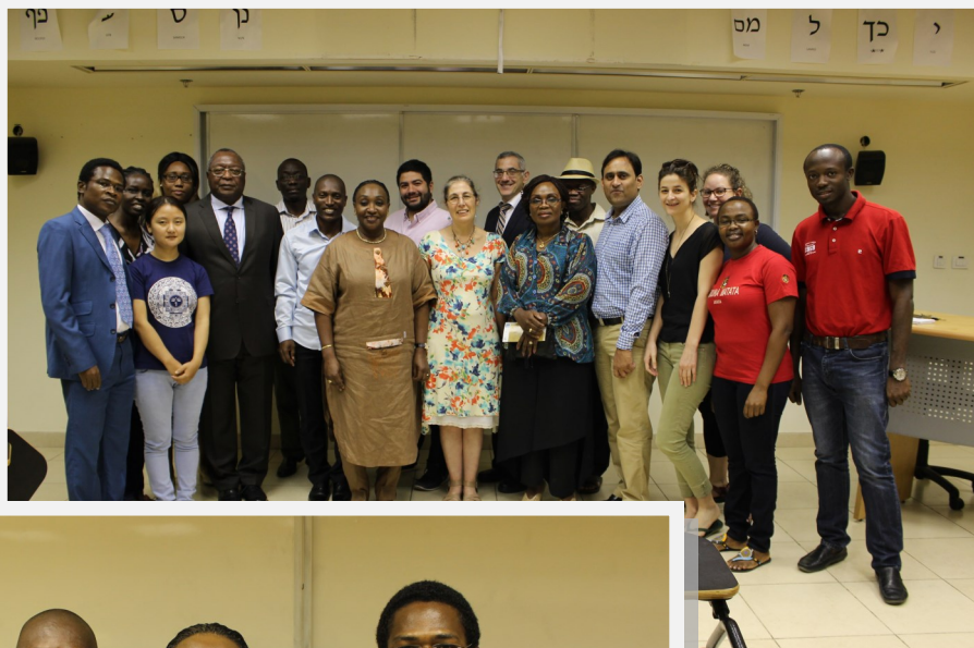
The Ivory Coast Minister of Health with the IMPH Class of 2014/2015