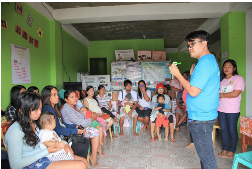
Teaching Filipino mothers how to use a Mid-upper Arm Circumference tape at home so they can monitor their child's nutritional status

I am currently one of the Nutrition Specialists of UNICEF Philippines tasked to provide focused technical assistance to the DOH and the National Nutrition Council (NNC) on Nutrition, particularly the First 1000 days and the prevention and treatment of all forms of malnutrition especially during emergencies and disasters. To date, my most significant legacy to my country consists of the finalization and adoption of two national laws relevant to maternal, infant and young child nutrition, 6 national policies on health emergency management and nutrition, and the development and publication of relevant guidelines, training manuals and studies.