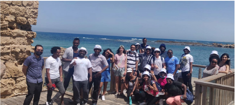
a trip to the North. IMPH 2021