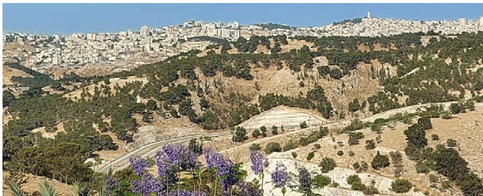
Early this morning from my balcony, Jerusalem looks and sounds so calm. May it soon be so again!