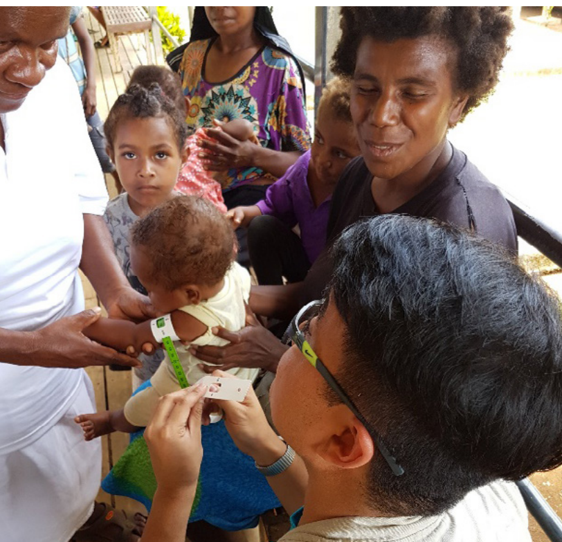
Teaching a health worker in Papua New Guinea how to correctly identify acute malnutrition in children

Within 2 months after my IMPH Graduation, the Philippines suffered three major disasters one after another – a human-induced conflict in September, an earthquake in October, and one of the strongest supertyphoons recorded in history in November. UNICEF Philippines urgently needed a Nutrition in Emergencies Officer to provide technical assistance to the National Government as part of its emergency response and recovery efforts. I was fortunate enough to have been selected and provided the needed support while also learning more about nutrition over the two years. Through analysis of the nutritional status of children affected by one of the worst typhoons experienced by the country in 2013, our team was able to document how well our emergency response interventions worked in decreasing the prevalence of severe acute malnutrition. Together with increasing capacity and demand from the communities we worked with, this study helped us to advocate for the development and adoption of DOH Administrative Order 2015-0055 or the National Guidelines on the Management of Acute Malnutrition.