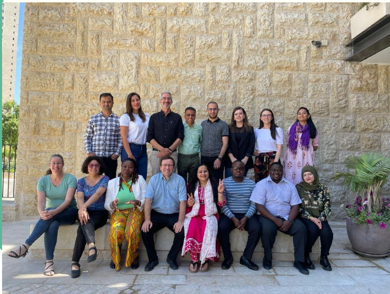
International Tobacco Control Workshop, June 2023